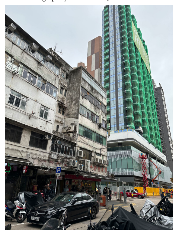
Figure 2. Street View in the Kowloon City District. The Residence Building under Construction (back) and the Old Buildings Pending to be Acquired (front).

Furthermore, there is indeed a practical reason for the re-inclusion: endorsing the urban redevelopment plan for the Kowloon City district (Figure 2). In 2011, the Hong Kong government declared a revision of the Urban Renewal Strategy, a district redevelopment plan that emphasises the importance of urban rejuvenation "by way of redevelopment, rehabilitation, revitalisation, and heritage preservation." Kowloon City, one of the oldest districts in Hong Kong, is at the forefront of the plan. To mitigate resistance to the redevelopment, the government leveraged local history and culture to legitimize the necessity and inevitability of changes in the local landscape. In 2018, a local history project titled "Kowloon City in Transformation: The Kowloon City Themed Walking Trail" was launched to rejuvenate the local culture by connecting various historical sites and buildings within the district. The project was funded by the Urban Renewal Fund and managed by the Hong Kong Sheng Kung Hui (Anglican Church). Apart from the walking trail, the project engaged the public through various events, guided tours, and the publication of newsletters and books.