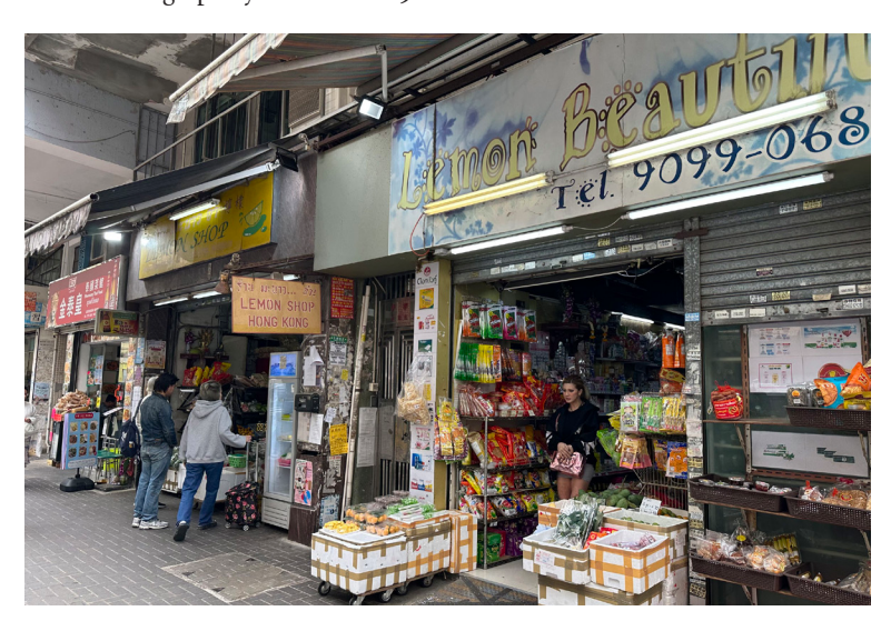
Figure 3. Street View in the Kowloon City District. Thai Groceries and Restaurants on the Main Street.

Despite the renewal of KWC Park in the 2000s revealing an attempt to reinclude the post-war history of the area, this inclusion is also a result of selection. The local memory is redefined by de-emphasizing the non-Chinese memory and neglecting the diversity of